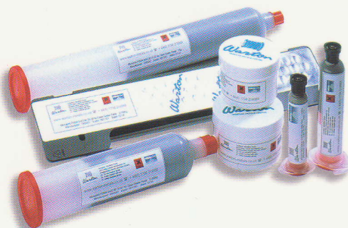
Lead Free Alloys Available

A range of colophony free solder pastes suitable for applications where washing is necessary.