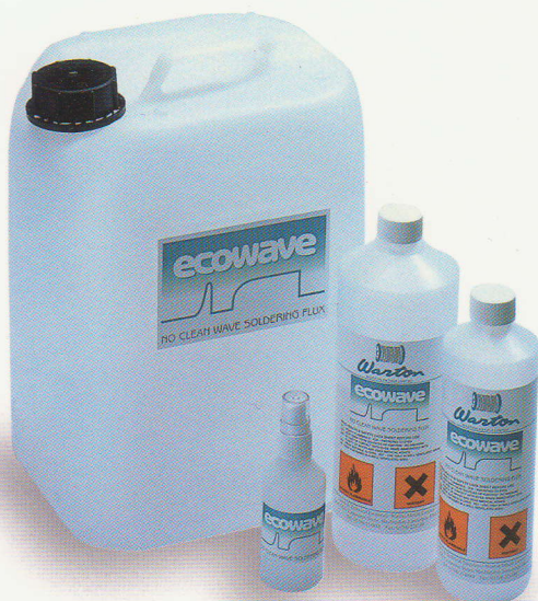
Lead Free Ready Technology

A range of high solids fluxes for transformer and cable manufacturing. Dipping fluxes are available as rosin based, no clean, water soluble, halide activated and halide free flux formulations.